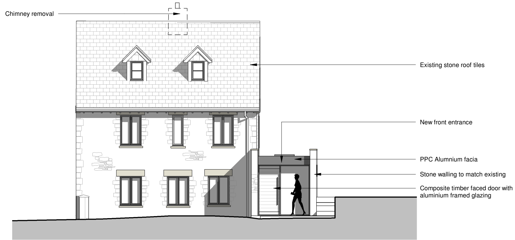
Proposed Front Elevation_North West

Do not scale from this drawing for construction or acquisition purposes. Responsibility is not accepted for errors made by others in scaling from this drawing. All construction information must be taken from figured dimensions only. All dimensions and levels must be checked on site and discrepancies between drawings and specification must be reported to Lewis Critchley Architects. © Copyright Lewis Critchley Architects